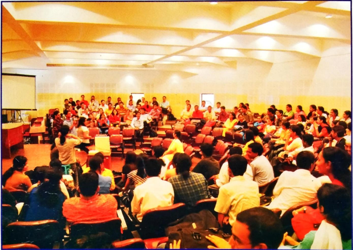
Faculty & students of SIESCOMS at an Audio-Video Presentation in the Auditorium of the College